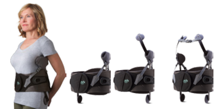
Multiple Options from One Brace

Multiple configuration options give providers the ability to customize a patient's treatment. The Peak Scoliosis Bracing System is modular which allows providers to assemble exactly the right brace for each patient, to ensure optimal comfort. As patients' needs or tolerances change over the course of care, the Peak Scoliosis Bracing System can be adapted as needed for the best possible outcome. If desired, a Dual Strut Configuration Kit offers additional components that provide kyphosis and rotational control.